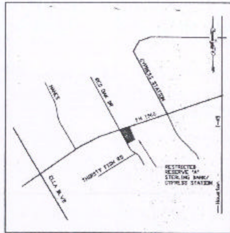
LOCATION MAP ( NOT TO SCALE )

Δ=19°00'54" R=696.05' L=231.00' CH=N 27°45'18" W - 229.94'