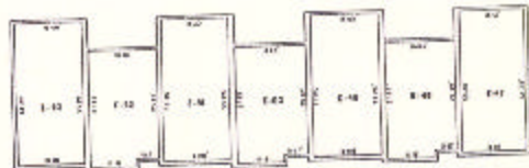
SECOND FLOOR P.L. 847 14 13