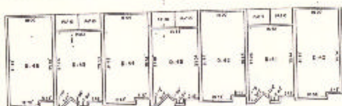
FIRST FLOOR P.L. 847 14 12