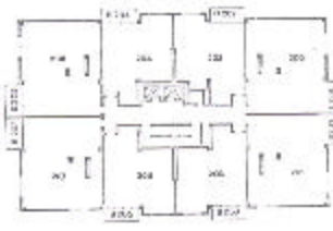
FLOOR - TWO BUILDING A